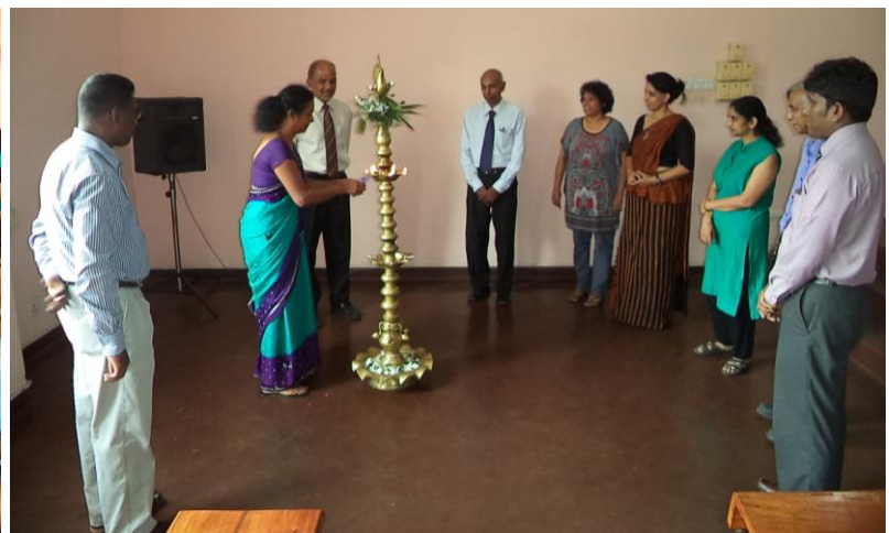
Lighting the traditional oil lamp at the inauguration of five M.Sc. programmes, held on June 23, 2014