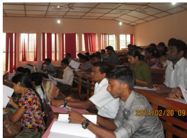
Participants of the 1 st National Workshop on Data Management, Analysis and Interpretation held on February 20 and 21, 2014