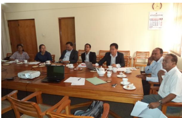
During a meeting with the delegation from the Royal University of Phnom Penh in Cambodia, who visited the PGIS on September 18 - 19, 2014