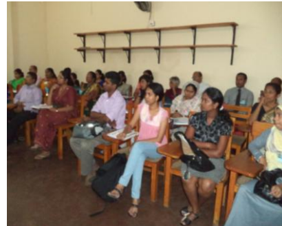
Participants of the PGIS Research Congress during technical sessions