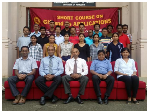
Participants of the 17 th Advanced Short Course (June 23 - 28, 2014)