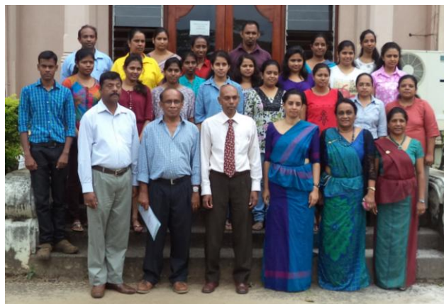
Left: Lighting of the traditional oil lamp at the inaugural session of the Workshop on Mushroom Production Technology held on July 18, 2014. Right: Participants of the workshop