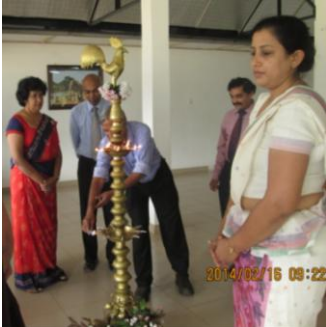
During the inauguration of M.Sc. and Postgraduate Diploma programme in Science Education, held on February 16, 2014