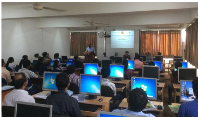
During a technical session of the GIS Training Programme on Landscape Archaeology held during October 3 and 6 - 9, 2014