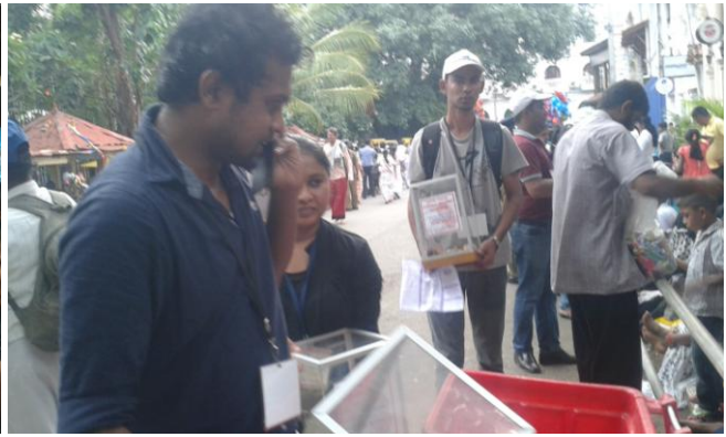
YRF members participating in a community service project to raise funds for the Kidney Protection Unit, Kandy Hospital during Esala Perahera 2014