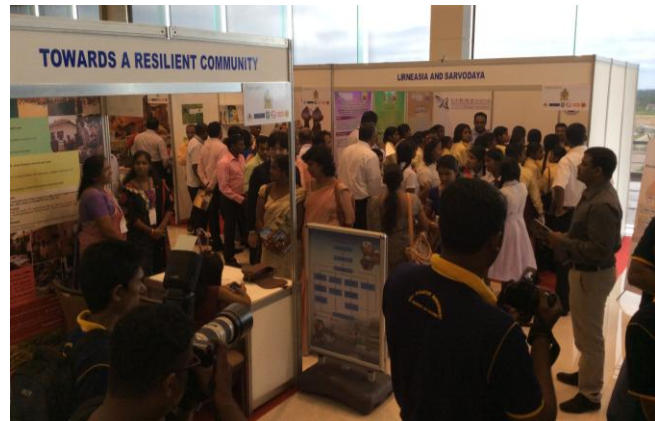
Crowds at the Disaster Resilient Leadership Exhibition, held in Hambanthota on December 26, 2014, organized as an activity parallel to '10 th Anniversary of Tsunami 2004 - Activities'