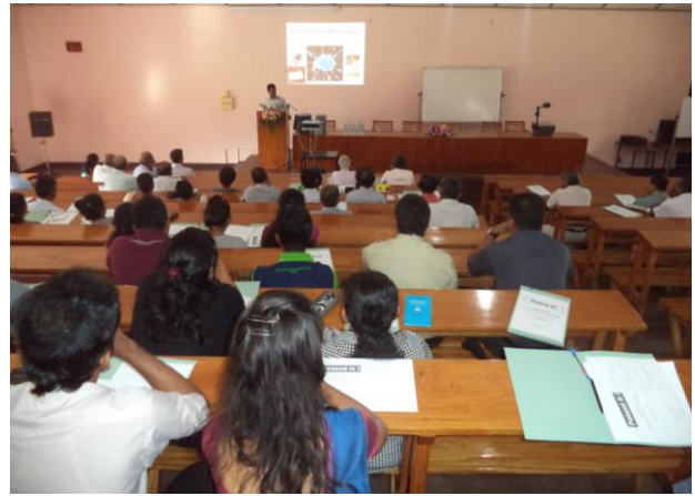
Participants during the inaugural session and a technical session of the Workshop on Intellectual Property and Patents held on December 19, 2014