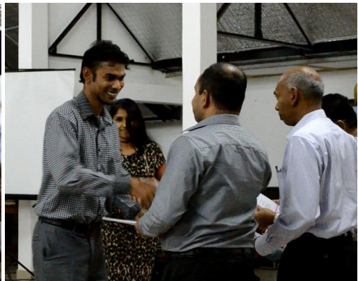
During the launching of the inaugural issue of the YRF magazine 'SCISCITATOR' on June 23, 2014