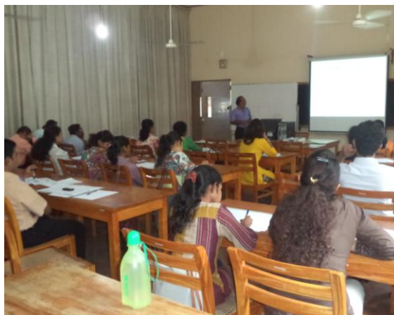
Participants of the Workshop on Plant Defense held on October 31, 2014