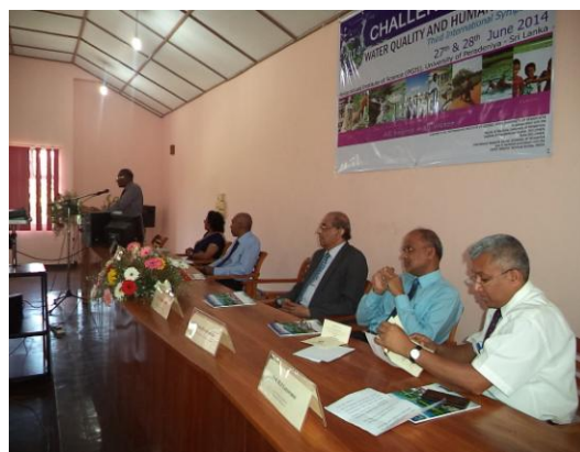
Participants at the inaugural session of the 3 rd International Symposium on Water Quality and Human Health held on June 27 and 28, 2014