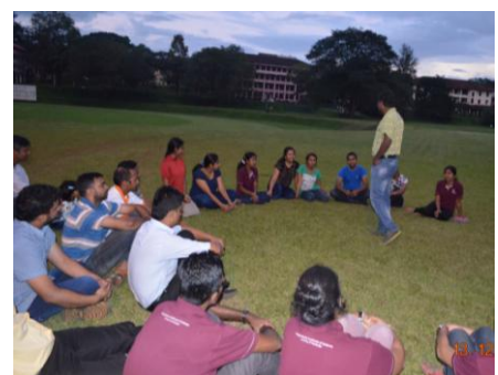
Participation of YRF members in the academic and social activities of the "Research Frontiers 2014 - Young Researchers' Camp" held on December 13 and 14, 2014