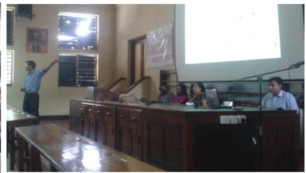
Undergraduate students during a panel discussion on 'Applying for graduate studies' held on October 29, 2014