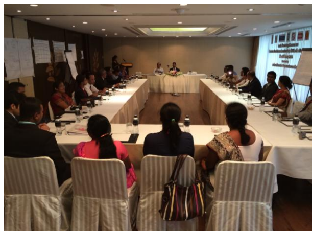
Left: Participants during a technical session of the 4 th Regional Training Course on ‘Disaster Resilient Leadership’ held from 17 th to 21 st March 2014 at the Earls Regency Hotel. Right: Participants of the 5 th Regional Training Course held from 7 th to 11 th July, 2014 in Bangkok, Thailand