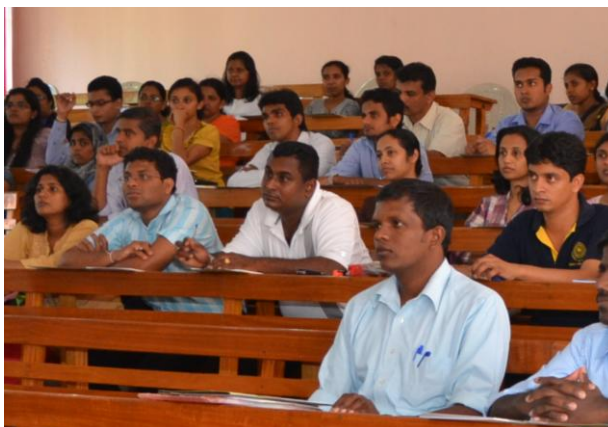
Participants of the 3 rd National Workshop on Scientific Writing (January 30 - 31, 2014) during technical sessions