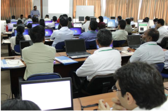
Participants of the 55 th Short Course (February 17 - 22, 2014)