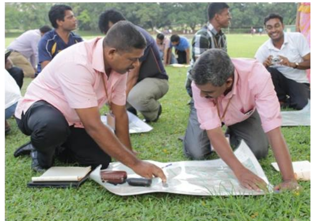
Participants of the 57 th Short Course (April 21 - 26, 2014) during a field class