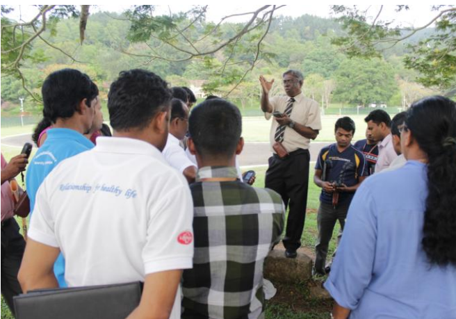
Participants of the 57 th Short Course (April 21 - 26, 2014) at a field class