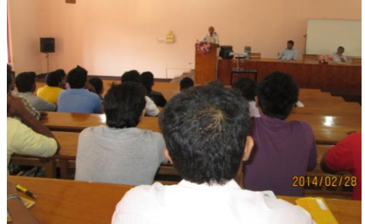
During the inauguration of M.Sc. programmes in Medical Physics and Physics of Materials, held on February 28, 2014