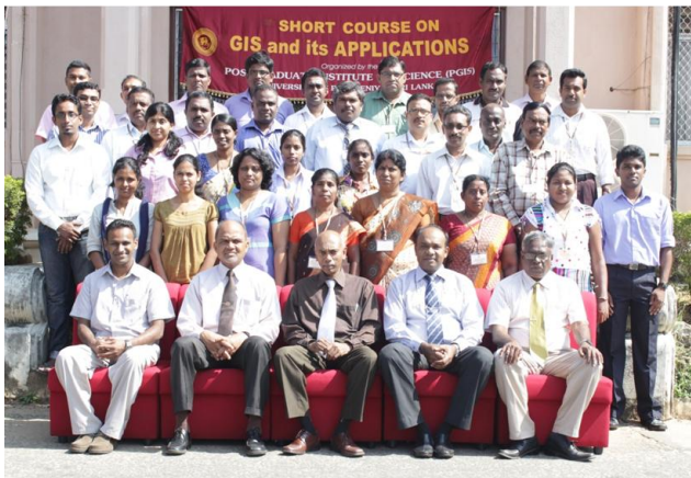
Participants of the 56 th Short Course (March 31 - April 5, 2014)