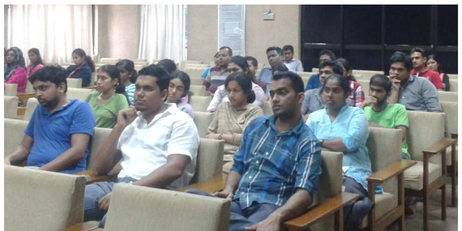
YRF membership drive and PGIS awareness activities held at NIFS, Hantana on November 26, 2014