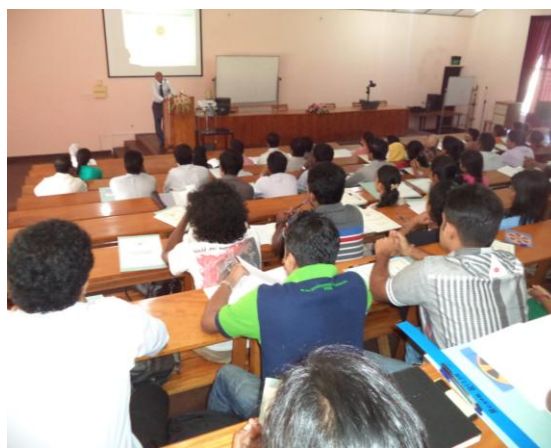
Participants of the 5 th National Workshop on Scientific Writing (December 4 - 5, 2014) during technical sessions