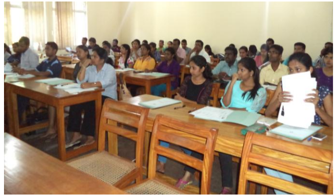
Participants during technical sessions of the Workshop on Electrochemical Water Treatment held on December 12, 2014